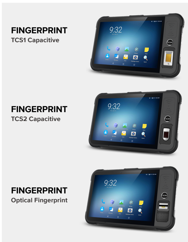
FINGERPRINT TCS1 Capacitive

Accurate Fingerprint Reading and Facial Recognition